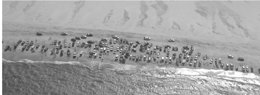
Cars on the beach at Cape Hatteras National Seashore, Memorial Day weekend, 2007 256

adopted its preferred alternative in order to “provide a reasonably balanced approach to designating ORV routes and vehicle-free areas and providing for the protection of park resources.” 255